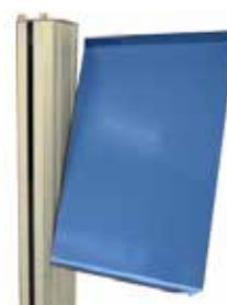
Writing pad Part.no: 15017