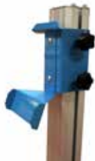
Angled fixture, checklist holder Part.no: 15019