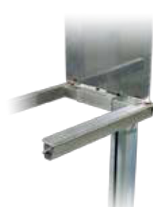
Adapter for handling crates of varying width Part.no: 15029