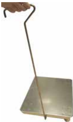
Dolly 760x360 cm Part.no: 95858