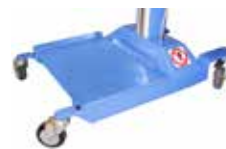
Crate holder for empty crates, to keep the surrounding floor clear. Part.no: 15024