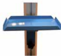
Shelf Part.no: 15016