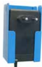
Holder for battery charger Part.no:17230A