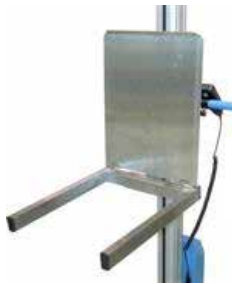
Loading platform, pharmacy model Part.no: 15012