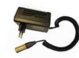
Battery charger 18V Part.no: 17134 24V Part.no: 19010

For more information please contact your sales representative.